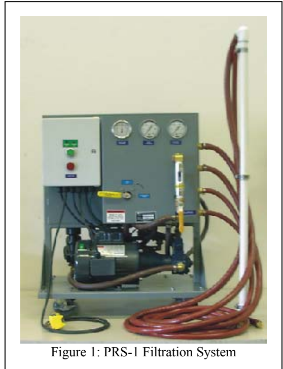
Figure 1: PRS-1 Filtration System

The company had evaluated several available filtration technologies, including FSI's PRS filtration system. The company concluded that only FSI's PRS system could meet all of the requirements listed above. After the evaluation, this company immediately purchased one PRS-1 (one gallon oil per minute capacity, as shown in Figure 1) filtration system used to recycle its spent oils.